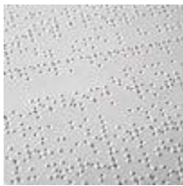
Signs, Signals, and Codes

Description: Computer or traditional animation tasks that will test a Scout’s creativity, artistic skills, and storytelling abilities.